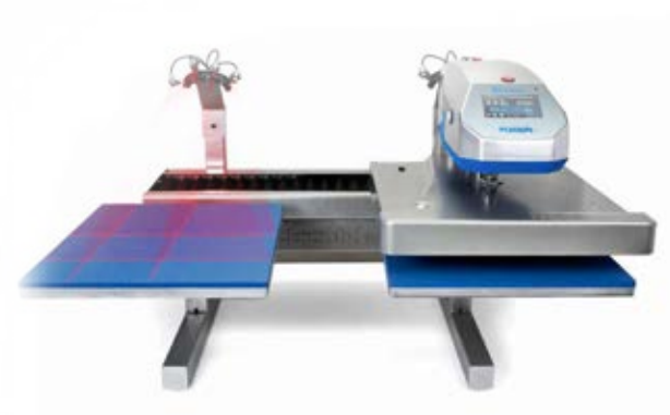
Stahls' Hotronix Dual Air Fusion