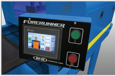
Load recipes with an easy-to-use touchscreen interface