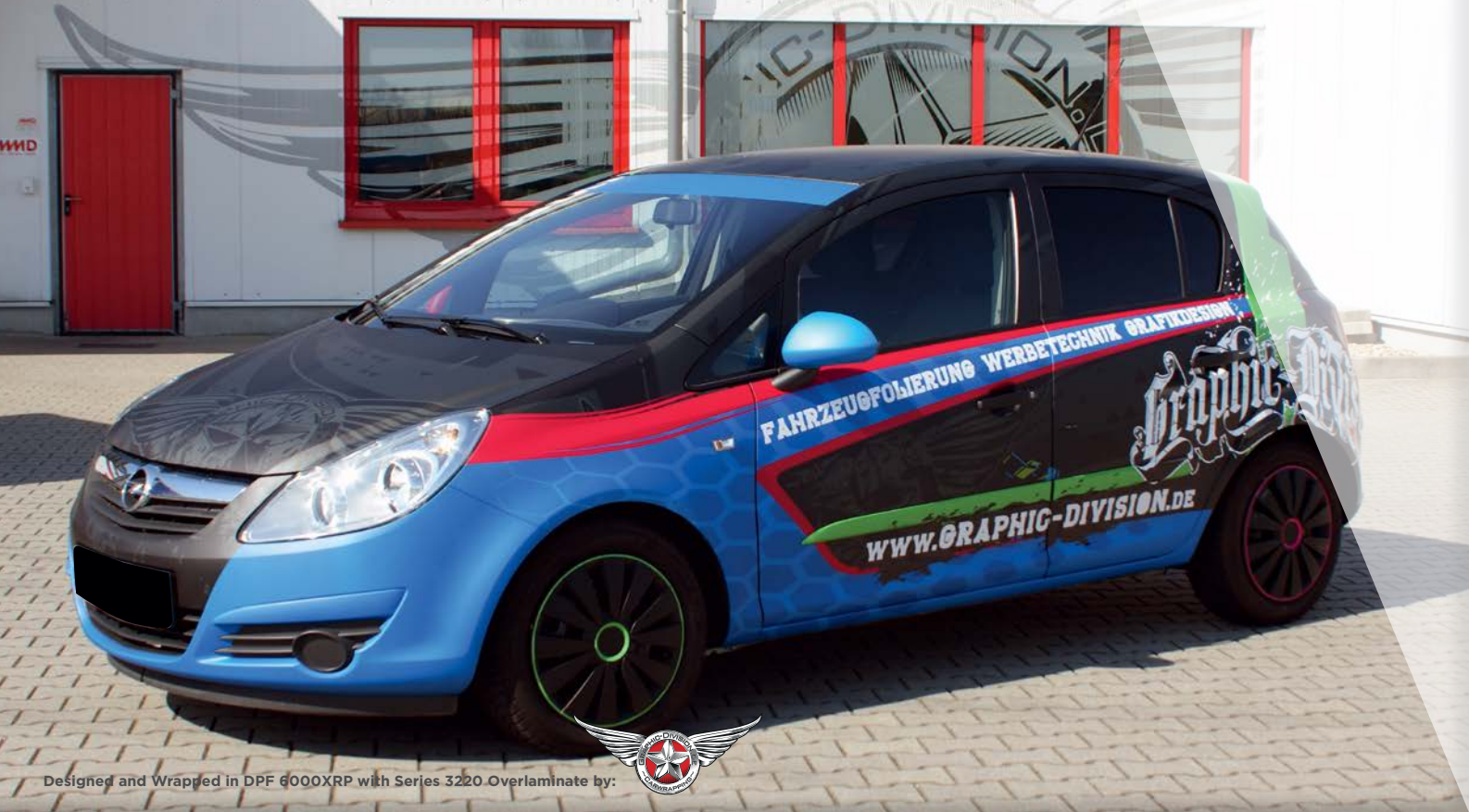
Designed and Wrapped in DPF 6000XRP with Series 3220 Overlamine by: