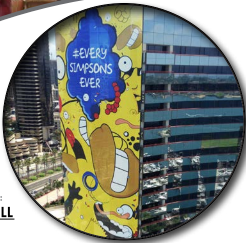
Wrapped in DPF 47WF by: OFF THE WALL Signs & Graphics

For more videos in this series, visit www.wrapitright.com .