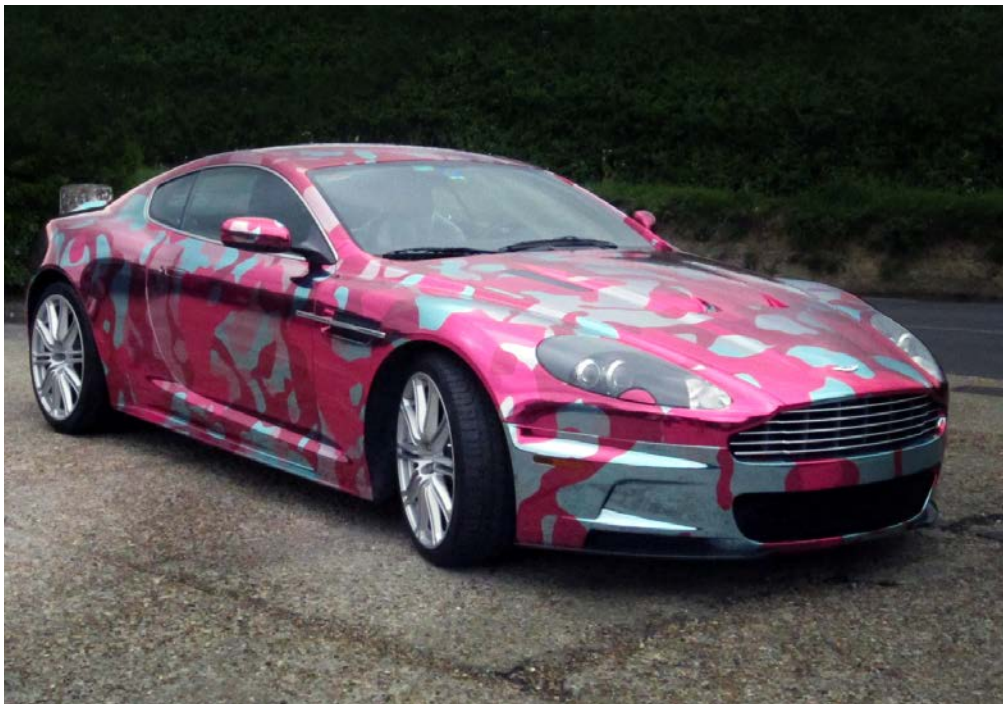
Designed and Wrapped in DPF 6000XRP with Series 3220 Overlamine by: Raccoon London LTD