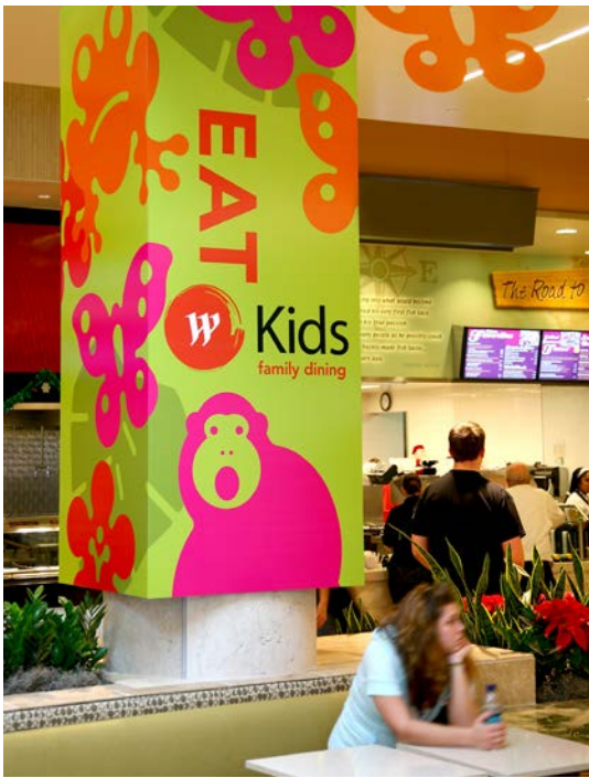
Wrapped in DPF 4500G White with Series 3420 Overlamine