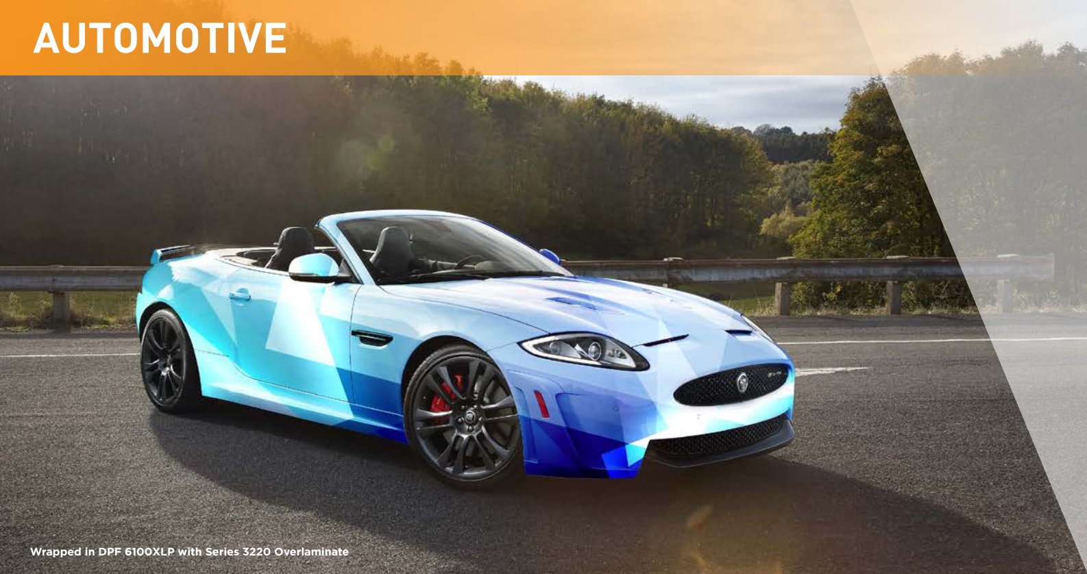
Wrapped in DPF 6100XLP with Series 3220 Overlaminate