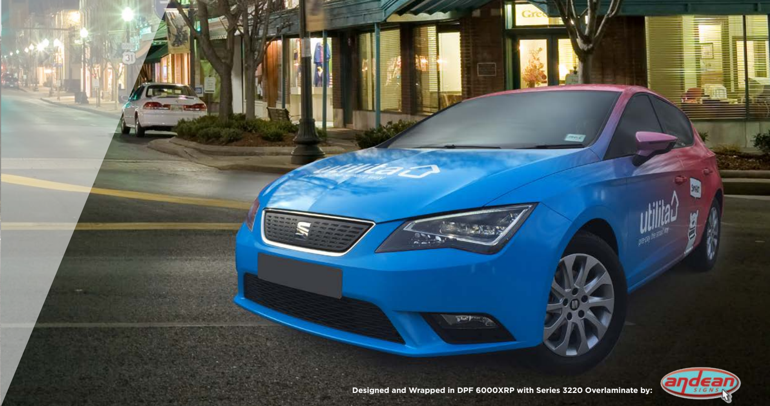
Designed and Wrapped in DPF 6000XRP with Series 3220 Overlaminate by: