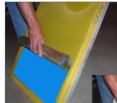
Step 1. Print Side

Note: Above times are based on using a 5KW Metal Halide Lamp.