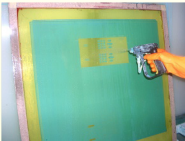
Step 1. After removal of ink, block-out, and tape, apply GEMZYME to a wet screen(both sides).

GEMZYME can be used in concentrated form, or it can be diluted up to 1 to 20 parts of water.