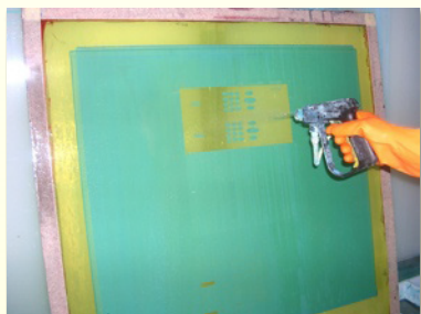
Step 1. After removal of ink, block-out, and tape, apply GEMZYME to a wet screen(both sides).

GEMZYME can be used in concentrated form, or it can be diluted up to 1 to 20 parts of water.