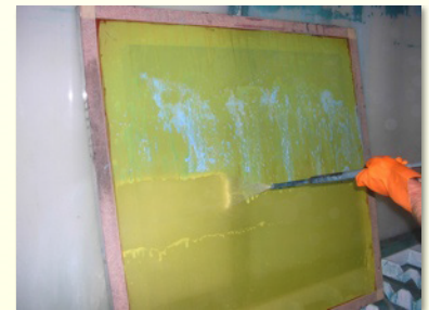
Step 3. High pressure rinse - starting at bottom.