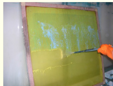
Step 3. High pressure rinse - starting at bottom.