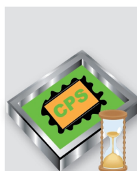
Leave for 30 seconds