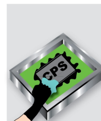
Apply to screen with cloth