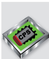
Removal of dried ink