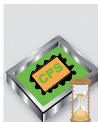
Leave for 30 seconds