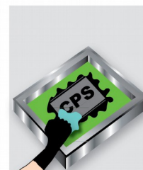
Apply to screen with cloth