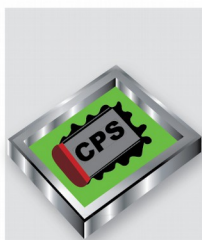
Removal of dried ink