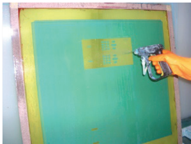
Step 1. After removal of ink, block-out, and tape, apply Eco-Strip®C to a wet screen (both sides).

Eco-Strip®C can be applied by a sponge, pad, spray bottle, dip tank, or pneumatic pump systems.