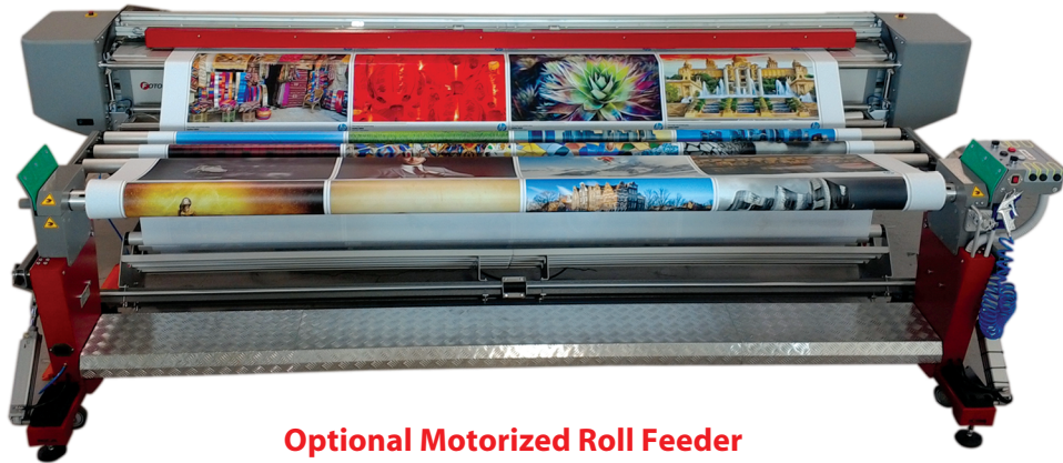
Optional Motorized Roll Feeder Can easily hold 660 lbs.

Spindle is compatible with HP Models LX 1500/3000/3100/3500