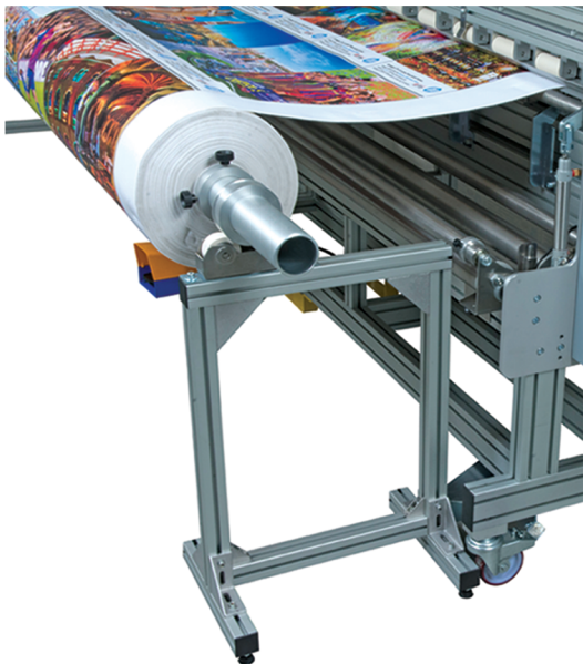
Heavy Duty Roll Feeder

The XL Series can handle media with a maximum thickness of 40 mil including polycarbonate, laminates and encapsulated media, photo paper, vinyl, self-adhesive vinyl, graphic arts film, duratrans, canvas and much more.