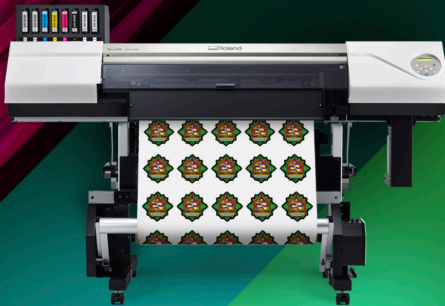
Device shown with optional TU-4 take-up unit.

WITH AN AFFORDABLE LABEL AND PACKAGING SOLUTION