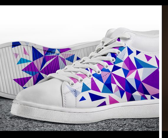
Print onto shoes, bags, and other large goods—ideal for leather, canvas and heavy materials.

The VersaUV LEF2-300D flatbed printer offers the size, speed and capabilities to build a successful customization business. It supports a maximum print area of 30" × 13" with a height clearance of 7.87" to allow you to print on a wider variety of objects and provides even more unique printing opportunities for your online storefront, retail store, sign shop, or other business.