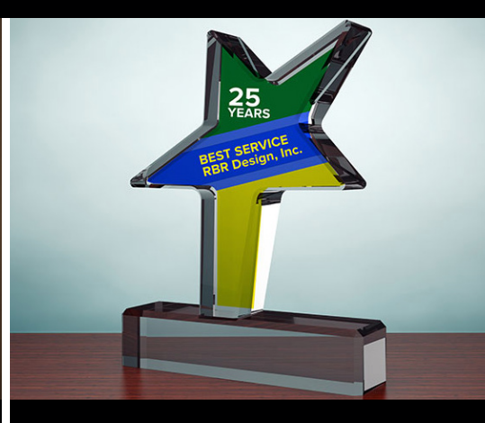
Put company branding, photos, and art onto a huge variety of awards, canvasses, giftware and many more items.