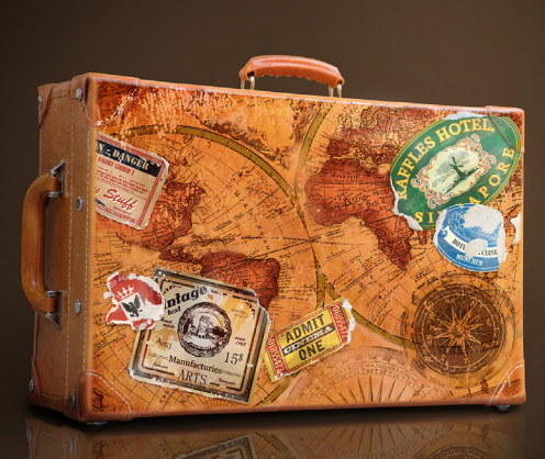
Customize larger merchandise, including cases, coolers, product prototypes, and other bulkier items.