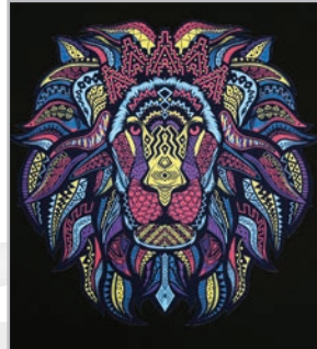
Fast, full-color prints

The Maverick's 12 industrial-grade printheads—six for White ink, plus Cyan, Magenta, Yellow, Black, Red and Green—ensure day-to-day performance and peace of mind, and allow for a greater color gamut. Agitators in the White ink supply tanks and an entire ink re-circulation system ensure consistent results and trouble-free operation.