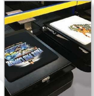
Dual shuttling independent pallets