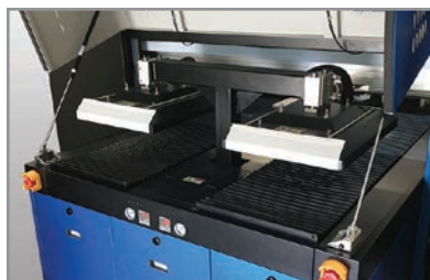
Built-in heat presses flatten fibers and heat garment surfaces prior to printing