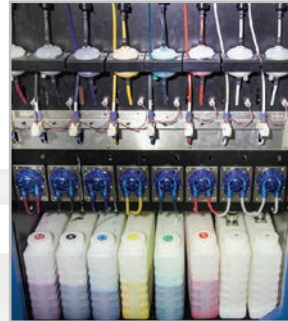
Re-circulating inks provide consistent results