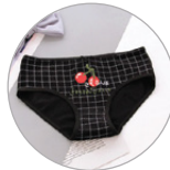
Other Specialty Items