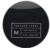
Tagless Neck Label

Now print on hoodies & a lot more with the all new standard pallets!