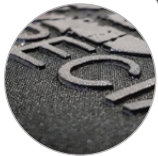
High Density Labels & Logos