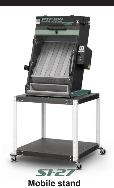
S1-27 W/D4-KIT Mobile stand w/ 4 drawers