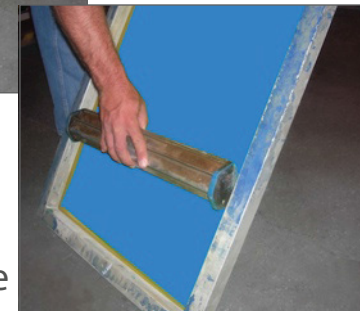
Step 2. Squeegee Side