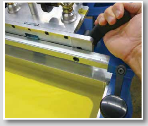
Convenient lever-actuated off-contact adjustment