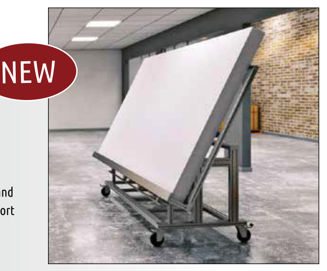
Quickly load a 6" stack of boards.

The All-A-Board Lifter® reduces the risk of injury to your operators and damage to valuable rigid substrates. One operator can easily transport and lift up to 500 lbs. of 4' x 10' media. Load boards stored on skids onto the All-A-Board Lifter® in the vertical position, then maneuver them through doorways and narrow aisles right up to your flatbed printer or cutter. The top rotates and locks into a flat position to feed boards into the printer or cutter one sheet at a time.