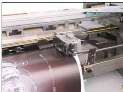
The sensor automatically follows the prints

The XLD170 cuts a full roll in 12 minutes! *