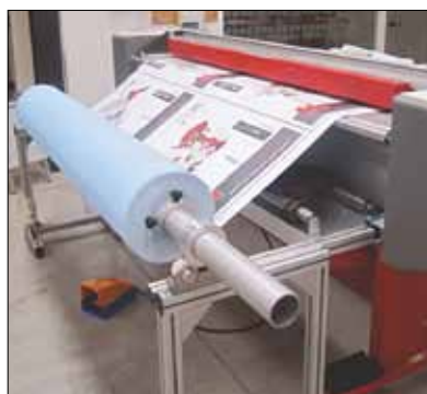
Easy loading of heavy rolls (optional)