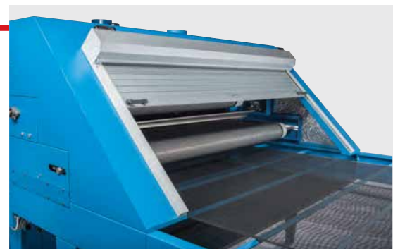
INTEGRATED ROLL-DOWN OUTFEED HOOD

3 Normal usage varies, but is significantly lower than the stated maximum