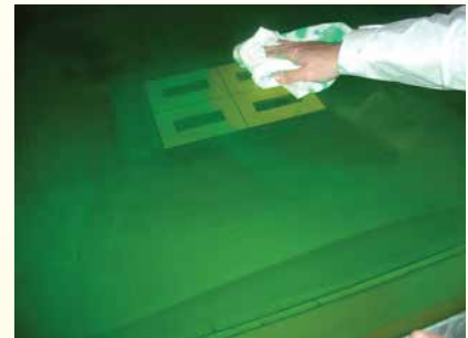
Step 3. Use rags or towels to wipe up ink residue. Re-apply to clean up ink residue in image area.