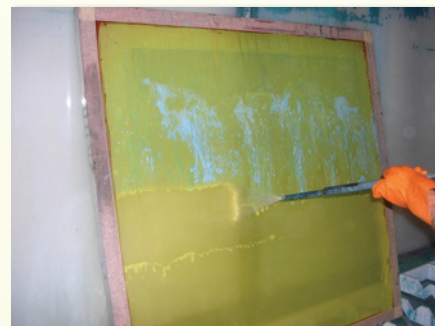
Step 3. High pressure rinse - starting at bottom.