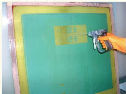
Step 1. After removal of ink, block-out, and tape, apply SUPRA-C to a wet screen(both sides).

SUPRA-C can be used in concentrated form, or it can be diluted up to 1 to 5 parts of water. SUPRA-C can be applied by a sponge, pad, spray bottle, or pneumatic pump systems.