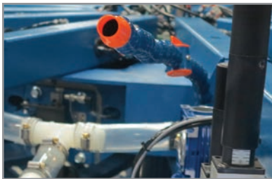
Adjustable delivery arms offer precise positioning