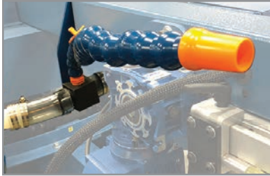
Individual valves regulate vapor delivery flow