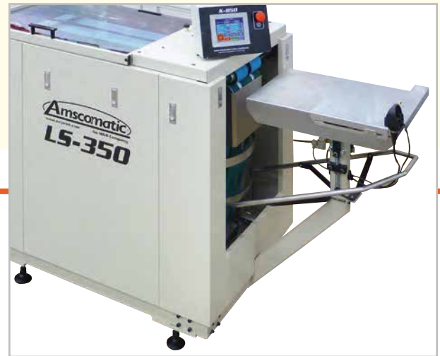
Optional LS-350 folder