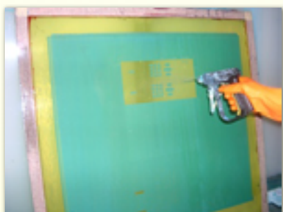
1) After removal of ink, block-out, and tape, apply CDR to a wet screen (both sides).

Emulsions, that are not properly broken down, will leave excessive residue on the mesh.