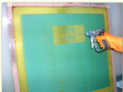
1) After removal of ink, block-out, and tape, apply CDR to a wet screen (both sides).

Emulsions, that are not properly broken down, will leave excessive residue on the mesh.