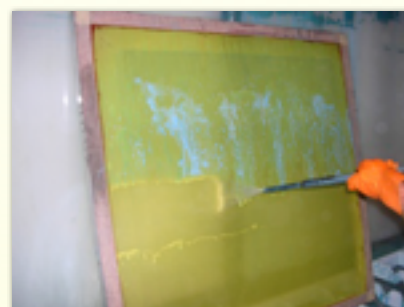
3. High pressure rinse - starting at bottom.