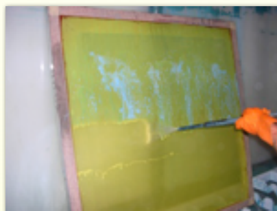
3. High pressure rinse - starting at bottom.