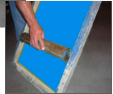
Step 2. Squeegee Side