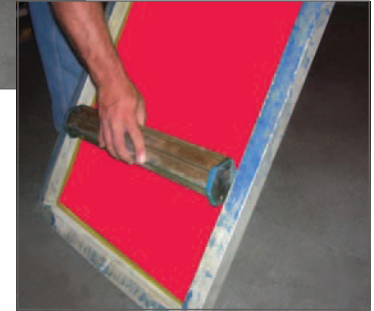
Step 2. Squeegee Side