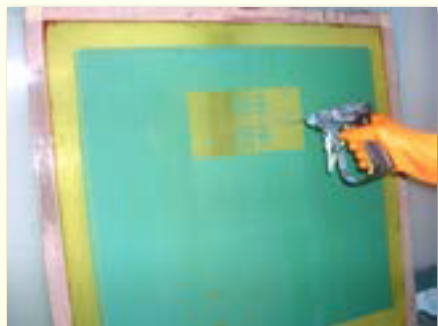
Step 1. After removal of ink, block-out, and tape, apply ER/35® to a wet screen (both sides).

ER/35® can be used in concentrated form, or it can be diluted up to 1 to 9 parts of water. ER/35® can be applied by a sponge, pad, spray bottle, or pneumatic pump systems.