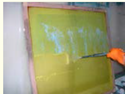
Step 3. High pressure rinse - starting at bottom.