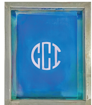
Step 4. End Result