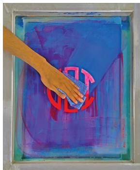
Step 2. Apply envirowipes to both side of screen