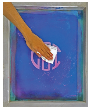
Step 3. Wipe away remaining residue with paper towel