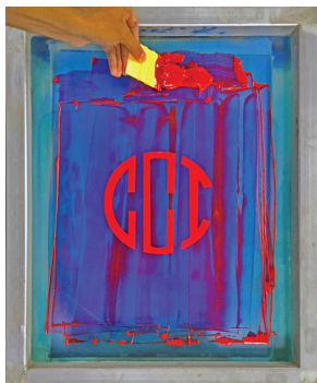
Step 1. Card excess ink from screen