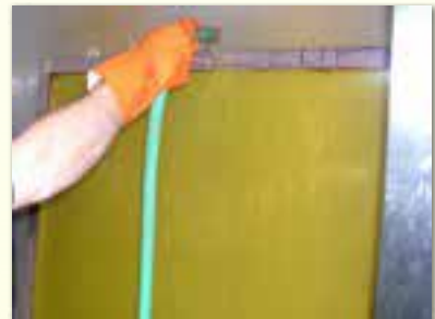
3. Flood rinse the screen starting at the top and washing all residue off the screen.