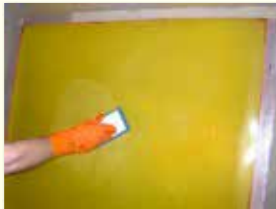
2. Scrub screen with non-abrasive pad or brush.