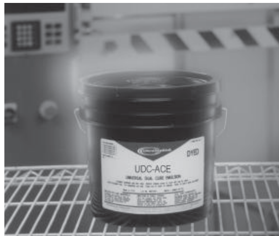
UDC-ACE emulsion is for use with water, solvent, co-solvent, UV and plastisol based inks. Available in dyed formulation only.