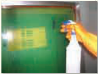
1. Spray ENVIROWASH on both sides of screen.