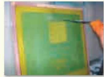
3. High pressure rinse - starting at bottom.

Look For More Information on all the Products in the ENVIROLINE™ of "Green" Chemistry.