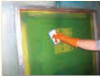
2. Scrub screen with non-abrasive pad or brush.