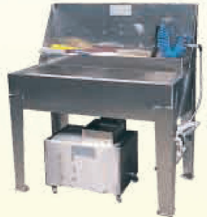
SQ 1000 Squeegee / Parts Washer

Look For More Information on all the Products in the ENVIROLINE™ of "Green" Chemistry.