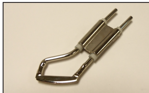
Model # 67102 Type R Blade

This general-use blade (1.14 inches of heated surface) cuts straight lines easily on glass surfaces and is designed for synthetic fabrics, webbing and ropes of up to 17mm diameter.