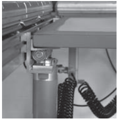
Screen frame support