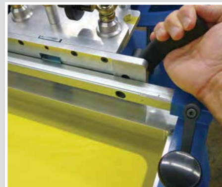
Convenient lever-actuated off-contact adjustment