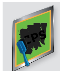
Apply with Blue CPS brush or brush pump