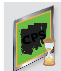
Leave for 2 minutes