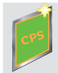
Stencil is ready for re-use or storage