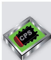
Removal of dried ink