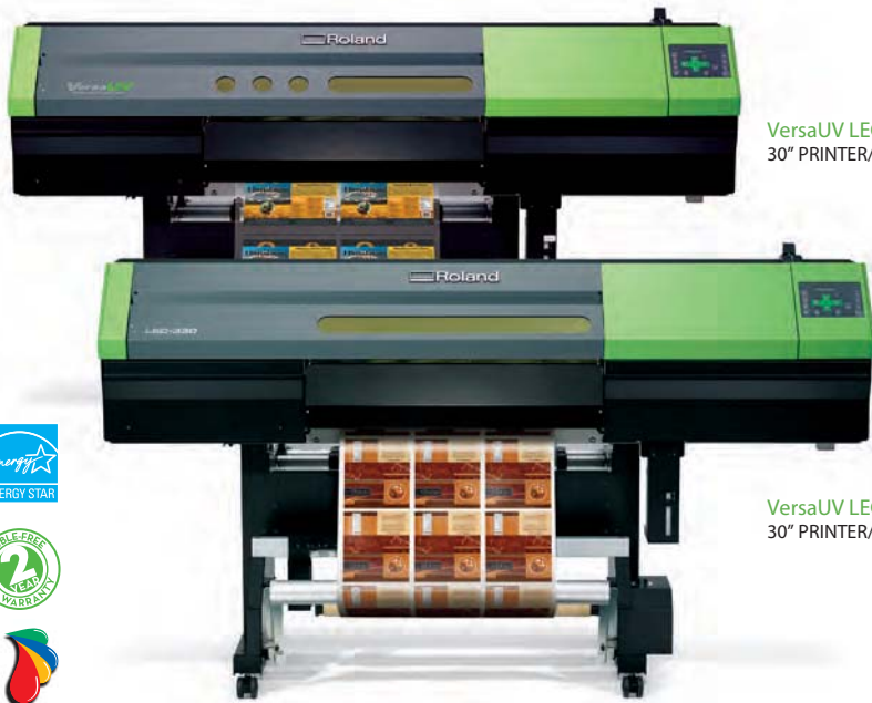
VersaUV LEC-300 30" PRINTER/CUTTER