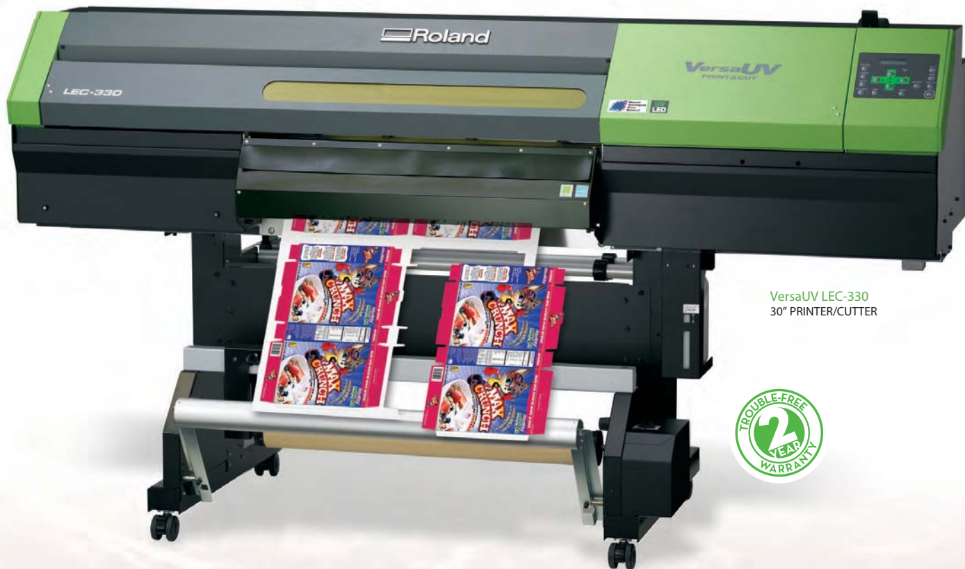
VersaUV LEC-330 30" PRINTER/CUTTER