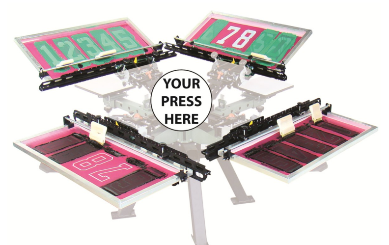
Shown is a four color press with a two color, 8" DiGiT numbering system